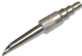
Product Name: IV Spike Connector Product Description: IV Connector for Use w / Reusable Tubing Part #: A010