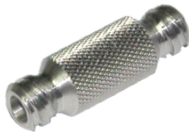
Product Name: Luer Lock to Luer Lock Product Description: Luer Lock to Luer Lock Syringe soft tissue transfer system