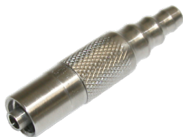
Product Name: Needle Connector Product Description: Needle Connector for Use w / Reusable Tubing Part #: A011