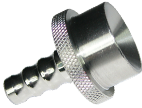
Product Name: Syringe Barb Adapter Product Description: Syringe Barb Adapter SS Part #: A057